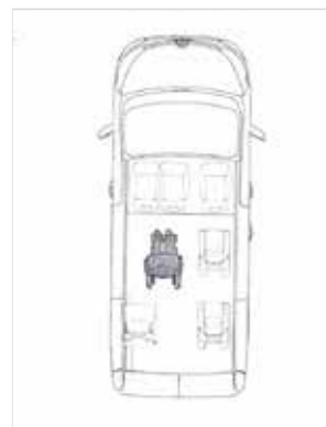
Maximum seating capacity using our standard conversion method with two fixed seats and one tip & fold seat