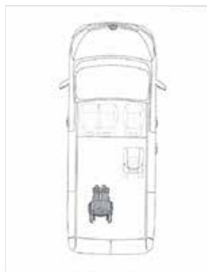
Alternative wheelchair position