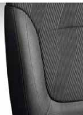
JAVA trim - standard on Sport versions