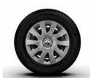
16" steel wheels