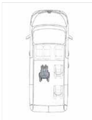
Popular upgrade is to add one additional rear seat