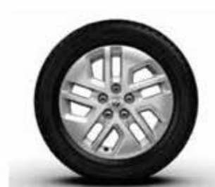
17" CYCLADE alloy wheels - standard on Sport versions