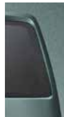
Bamboo Garden Green