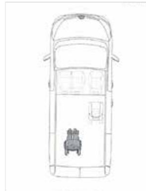
Alternative wheelchair position