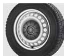
Steel Wheels - Standard on Startline