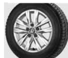
16" Clayton Alloy Wheels - Standard on Highline