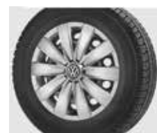
Full Width Wheel Trims - Standard on Trendline