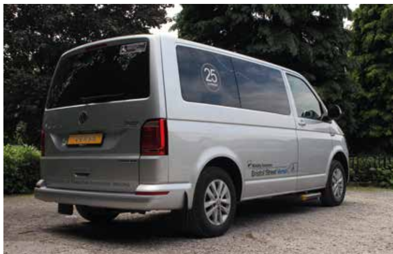
Specifications shown could be subject to change.