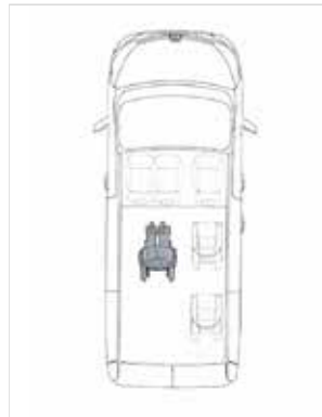
Popular upgrade is to add one additional rear seat