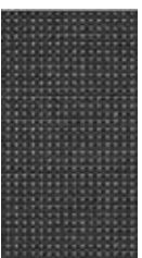
Austin - Standard on Startline