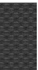
Simora - Standard on Trendline and Highline